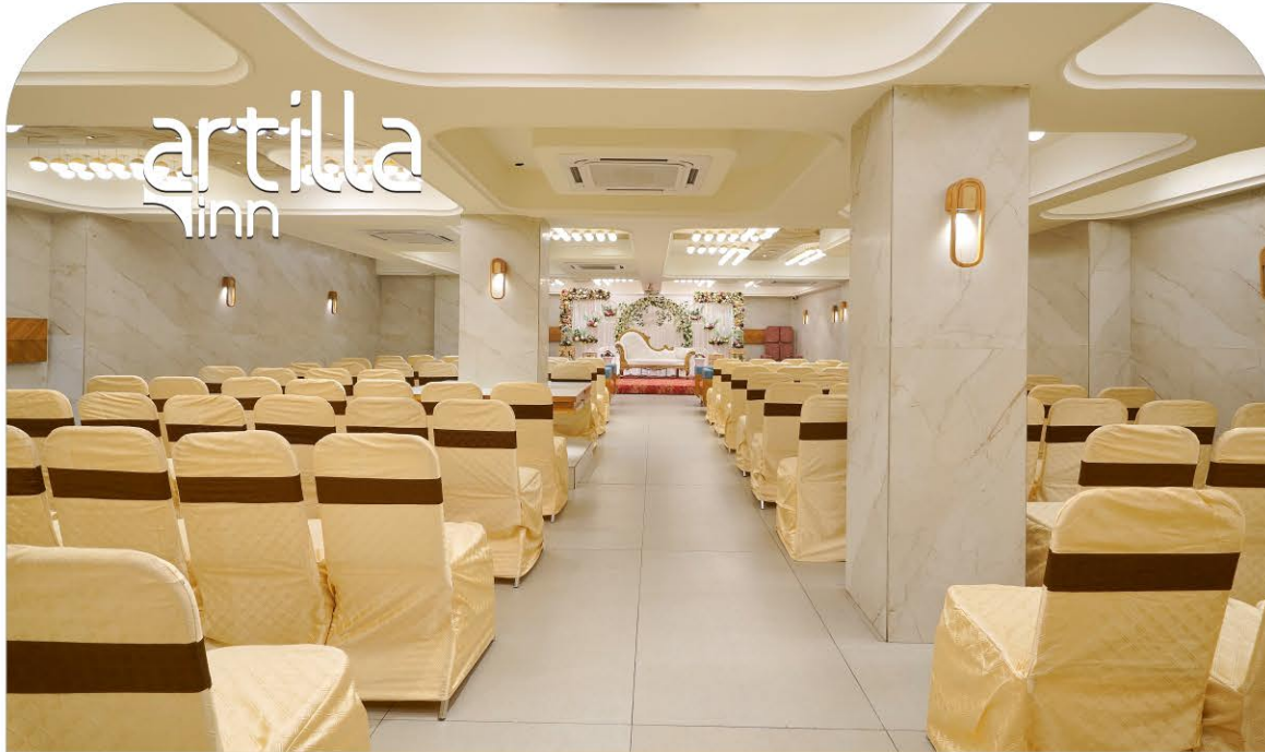
39 BUSINESS CLASS ROOMS & BANQUET CAPACITY UPTO 800 PERSONS